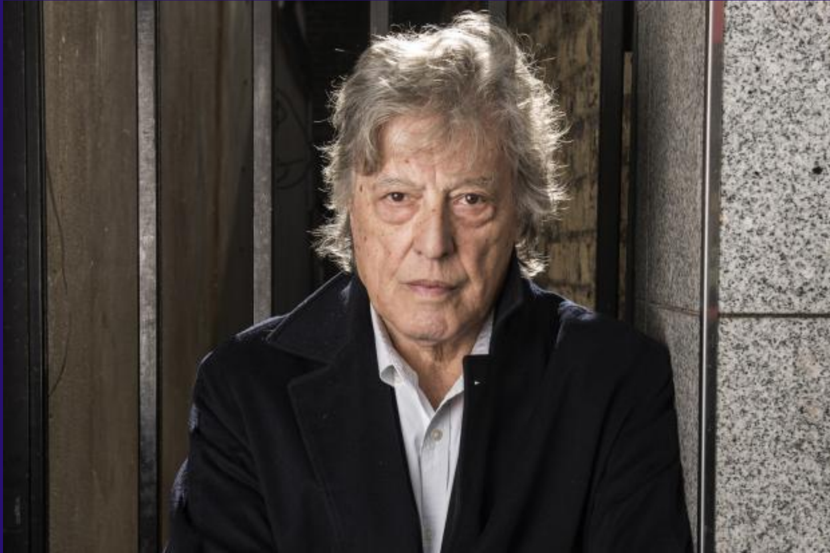
Tom Stoppard b. 1937