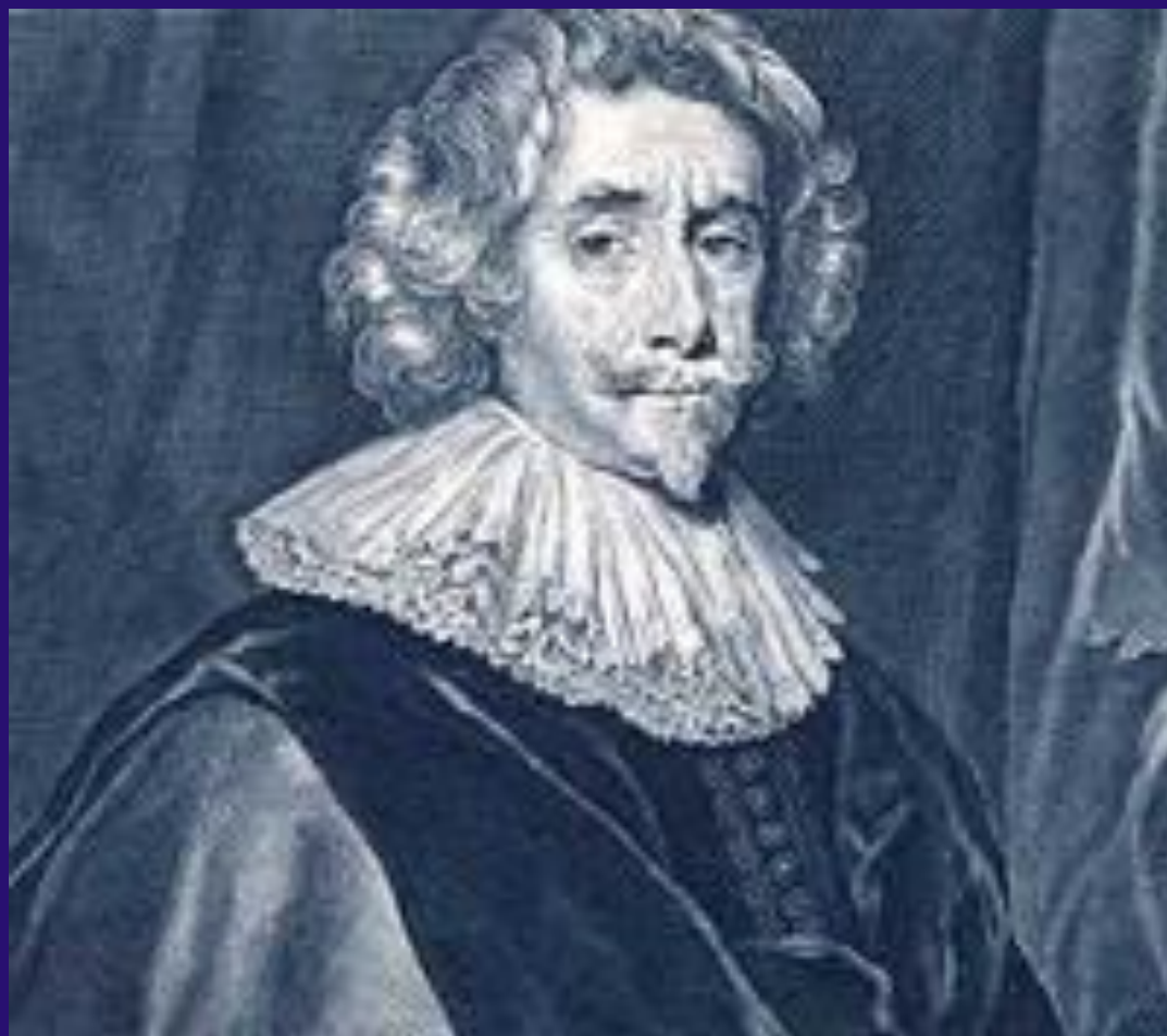
John Webster c. 1579-1632