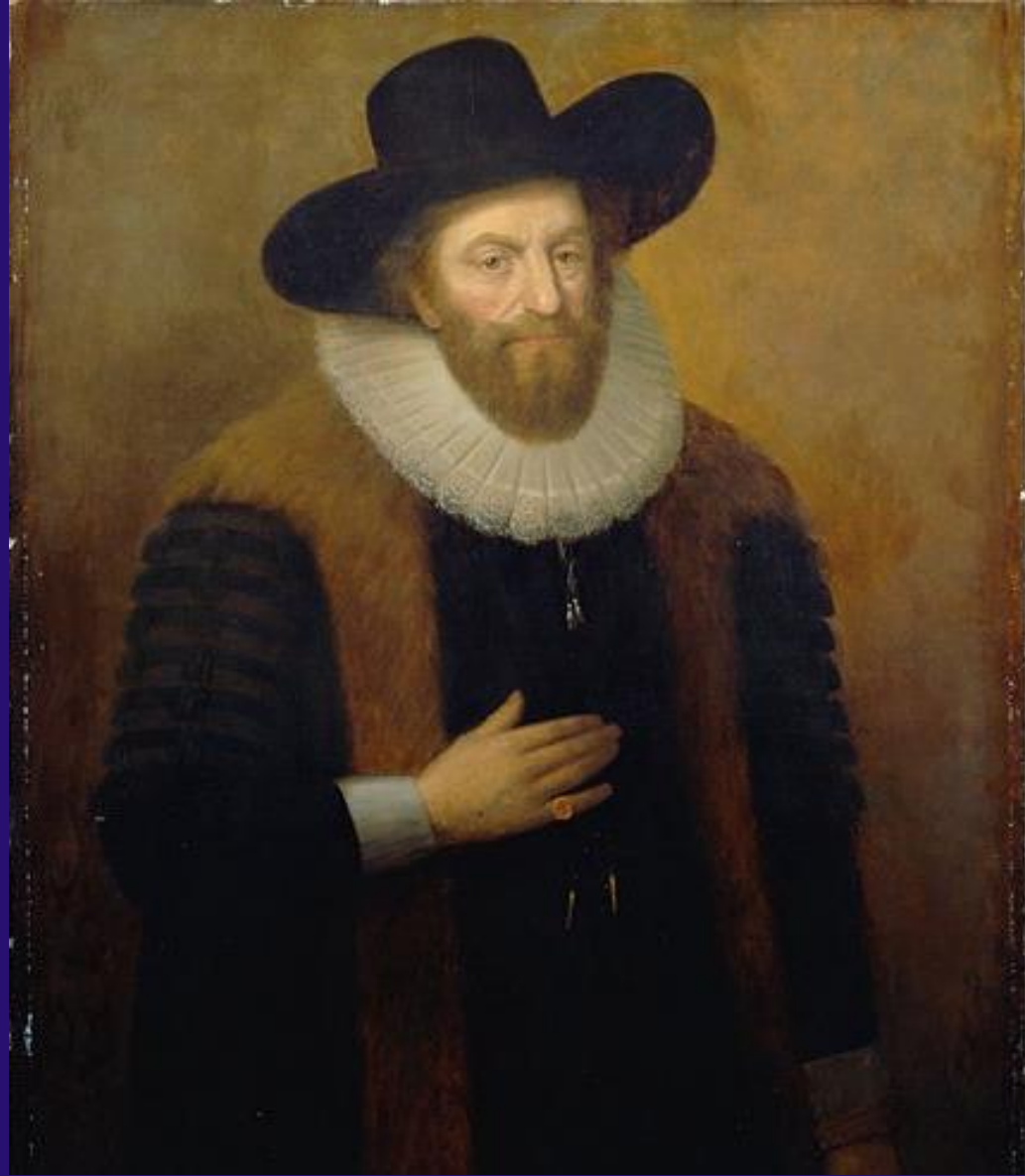
Philip Henslowe, 1550-1616