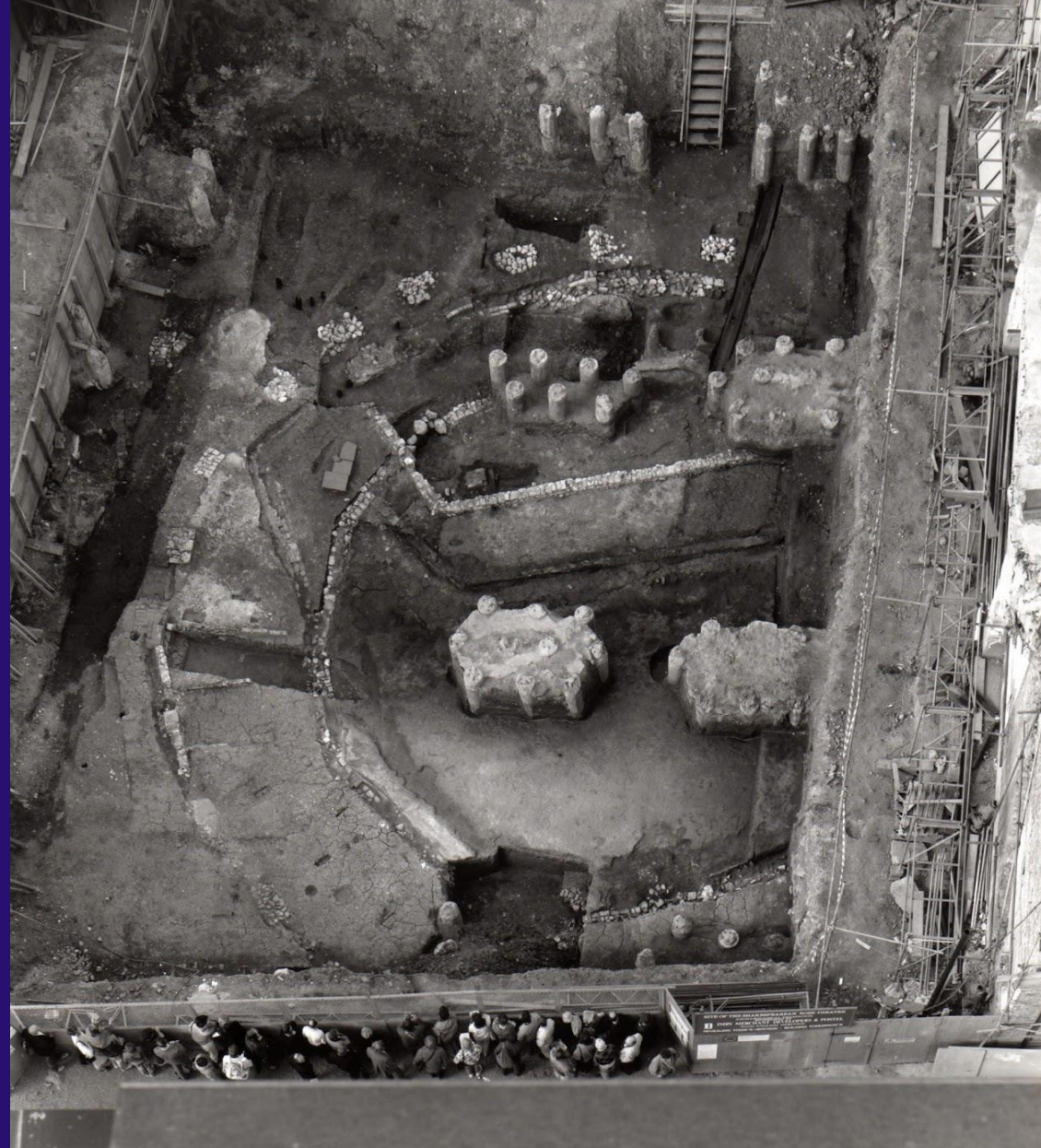
Rose Theatre Excavation